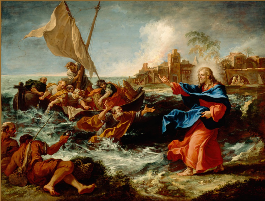
The Miraculous Draught of Fishes