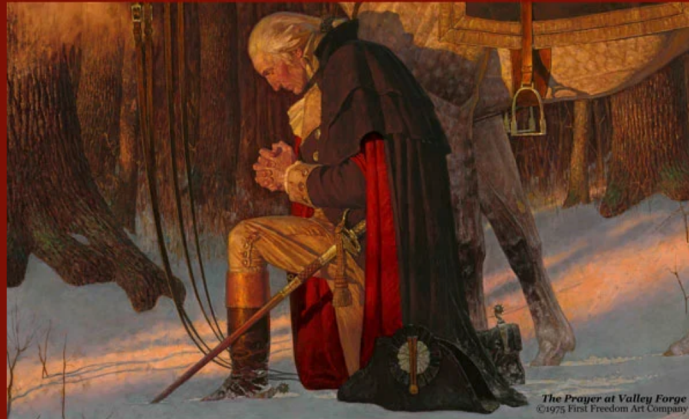
The Prayer at Valley Forge

SEEKING HIM IN ALL GENERATIONS 1 CHRONICLES 16:24 NASB