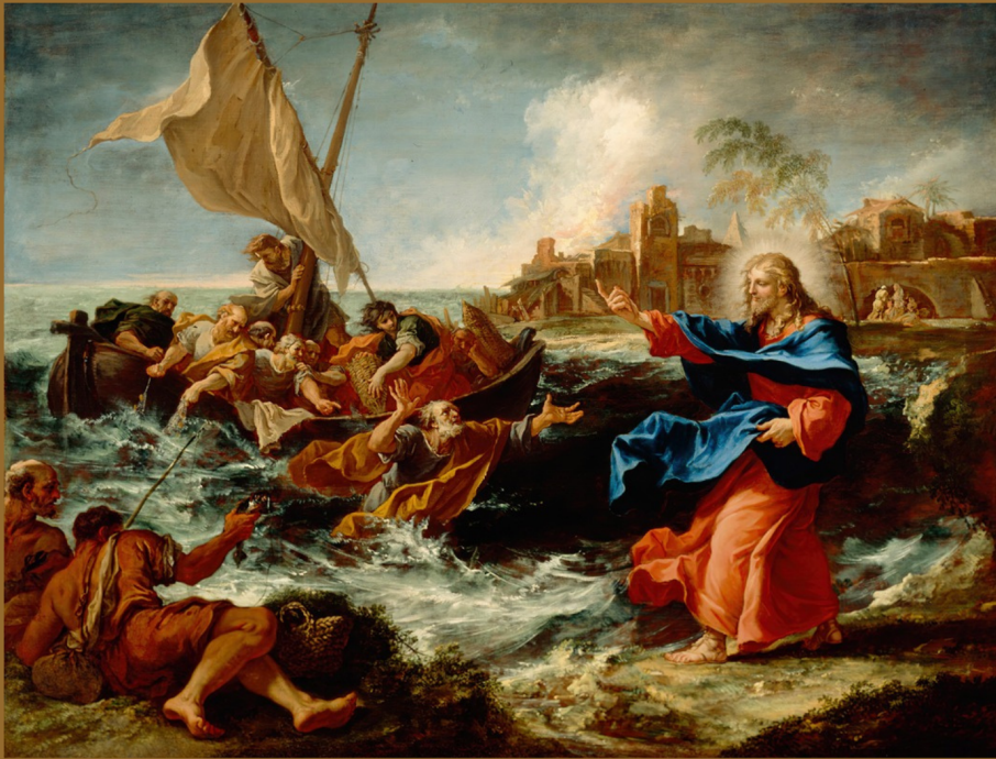
The Miraculous Draught of Fishes Sebastiano Ricci - Italian, 1659-1734