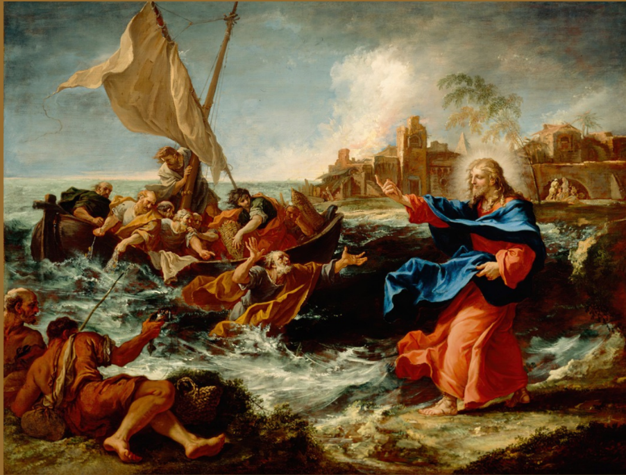
The Miraculous Draught of Fishes Sebastiano Ricci - Italian, 1659-1734