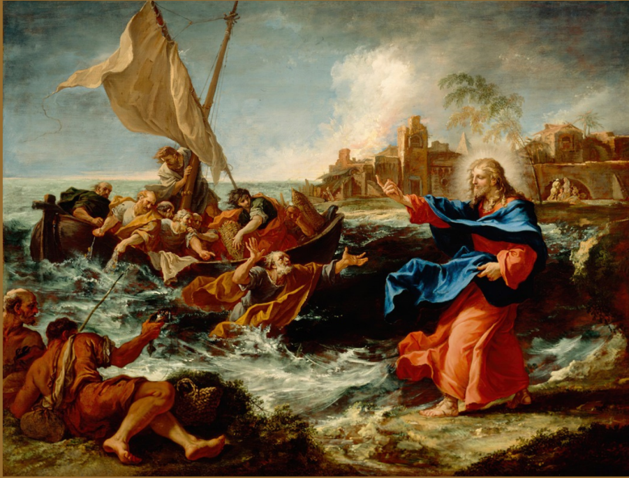
The Miraculous Draught of Fishes Sebastiano Ricci - Italian, 1659-1734